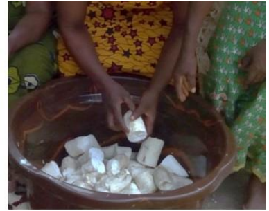
Attieke production site in PTP Camp.