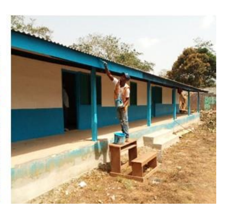
Refugees have supported the renovation works of the nurses' quarters at PTP Camp.