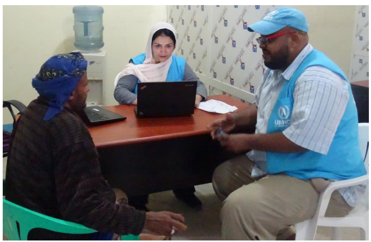
UNHCR staff members making an assessment of a Yemeni refugee at the Reception Centre in Berbera. © UNHCR/Berbera, December 2017