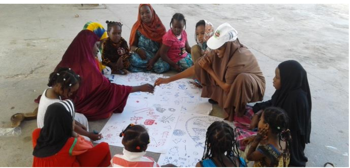
Somali returnees drawing their journey across sea from Yemen to Somalia at the Reception Centre in Berbera.