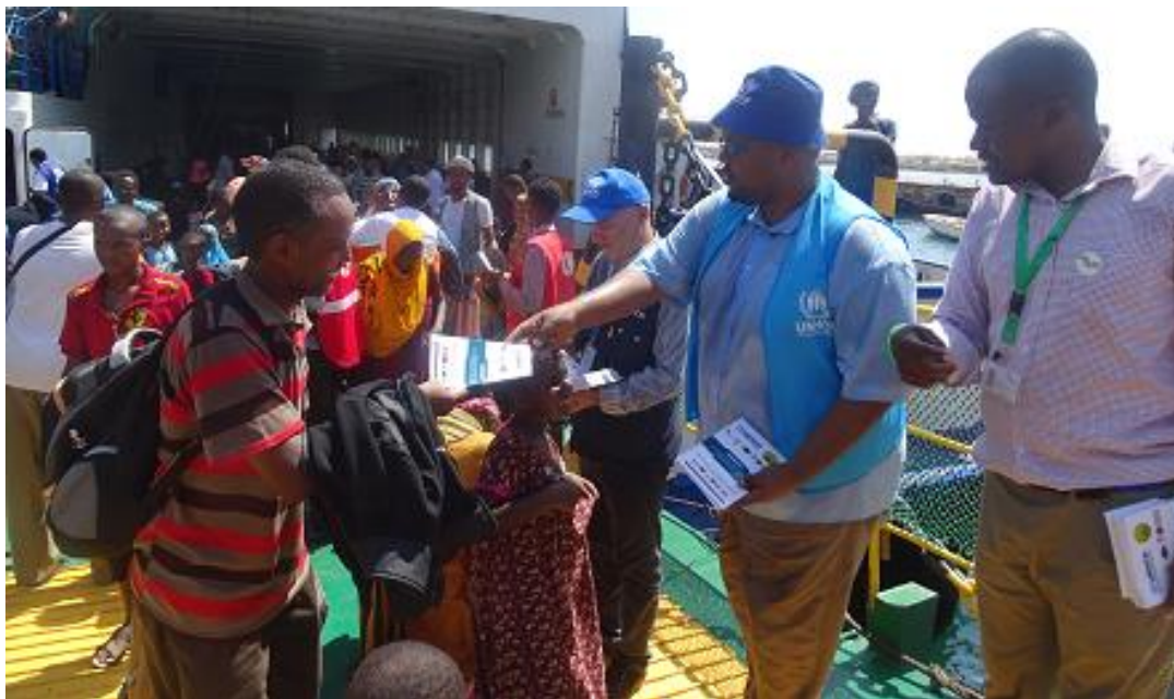
Somali returnees supported under the Assisted Spontaneous Return receiving leaflets on services available while disembarking at the Port in Berbera. © UNHCR / September 2017