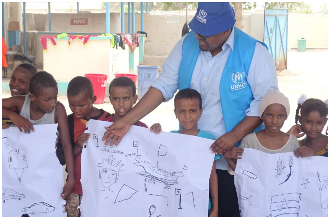
In Berbera, a UNHCR staff together with the Somali returnees. Returnee children draw pictures of their journey from Yemen to Somalia.