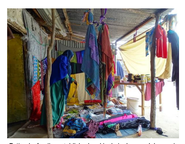
Fatima's family established a kiosk in Lower Juba region after they returned to Somalia © UNHCR / June, 2017

Fatima (not her real name), a mother of nine received an enhanced return package after she returned to Somalia in January 2017 and established a kiosk.