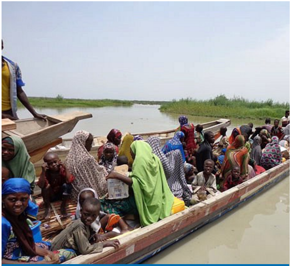
Nigerian refugees arrive on Lake Chad islands in Niger after fleeing attacks in Doron Bagga in Borno state, Nigeria IRC (UNHCR partner in

West Africa and the Sahel regions figured prominently in the discussions during the 71<sup>st</sup> session of the General Assembly, which opened on 19 September 2016 at the United Nations headquarters.