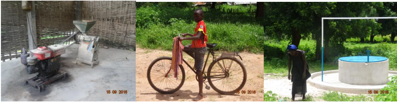
Rice Rusker provided to refugees in Cacheu / Refugee child using bicycle provided by IP / Local communities benefiting from well funded by UNHCR for irrigation for agricultural purpose