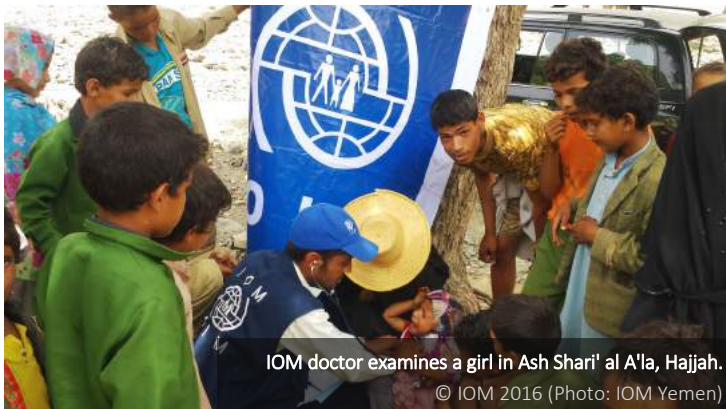
IOM doctor examines a girl in Ash Shari' al A'la, Hajjah.

Since the beginning of the crisis, 685,772 IDPs and conflict-affected persons (288,024 women, 308,597 men, 48,005 girls and 41,146 boys) have benefitted from IOM's WASH activities in Abyan, Aden, Al Dhale'e, Al Jawf, Hadhramaut, Ibb, Taizz Lahj, Sana'a and Shabwah governorates.