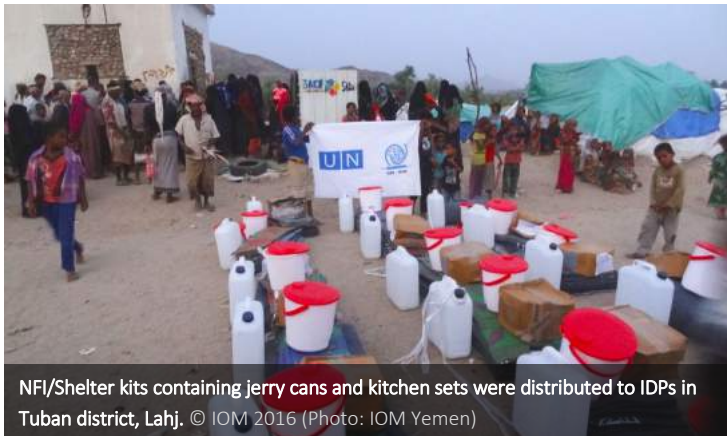
NFI/Shelter kits containing jerry cans and kitchen sets were distributed to IDPs in Tuban district, Lahj.

Since March 2015, IOM has assisted 64,934 IDPs in Abyan, Aden, Al Dhale'e, Hadhramaut, Hajjah, Lahj, Al Mahrah, Sa'adah, Shabwah, Socotra and Taizz governorates with shelter and NFI support.