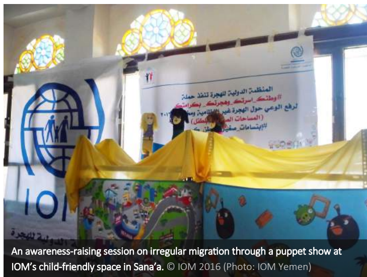
An awareness-raising session on irregular migration through a puppet show at IOM's child-friendly space in Sana'a.

Between 1 and 31 May, 1,204 individuals including 1,182 children participated in activities in the CFSs. Since the beginning of the crisis, 10,794 individuals have benefitted from activities provided at the CFSs.