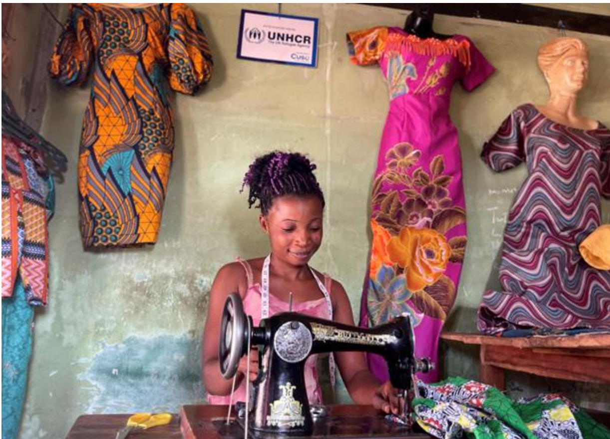
A Cameroonian refugee woman in Ogoja, Cross River State, skilfully stitches colourful dresses, a testament to the vocational training provided by UNHCR to enhance refugees' self-reliance.

UNHCR has handed over water and sanitation facilities to the government and host communities in Akwa Ibom State. These include solar-powered boreholes and refurbished latrines designed to serve both the refugees and local residents