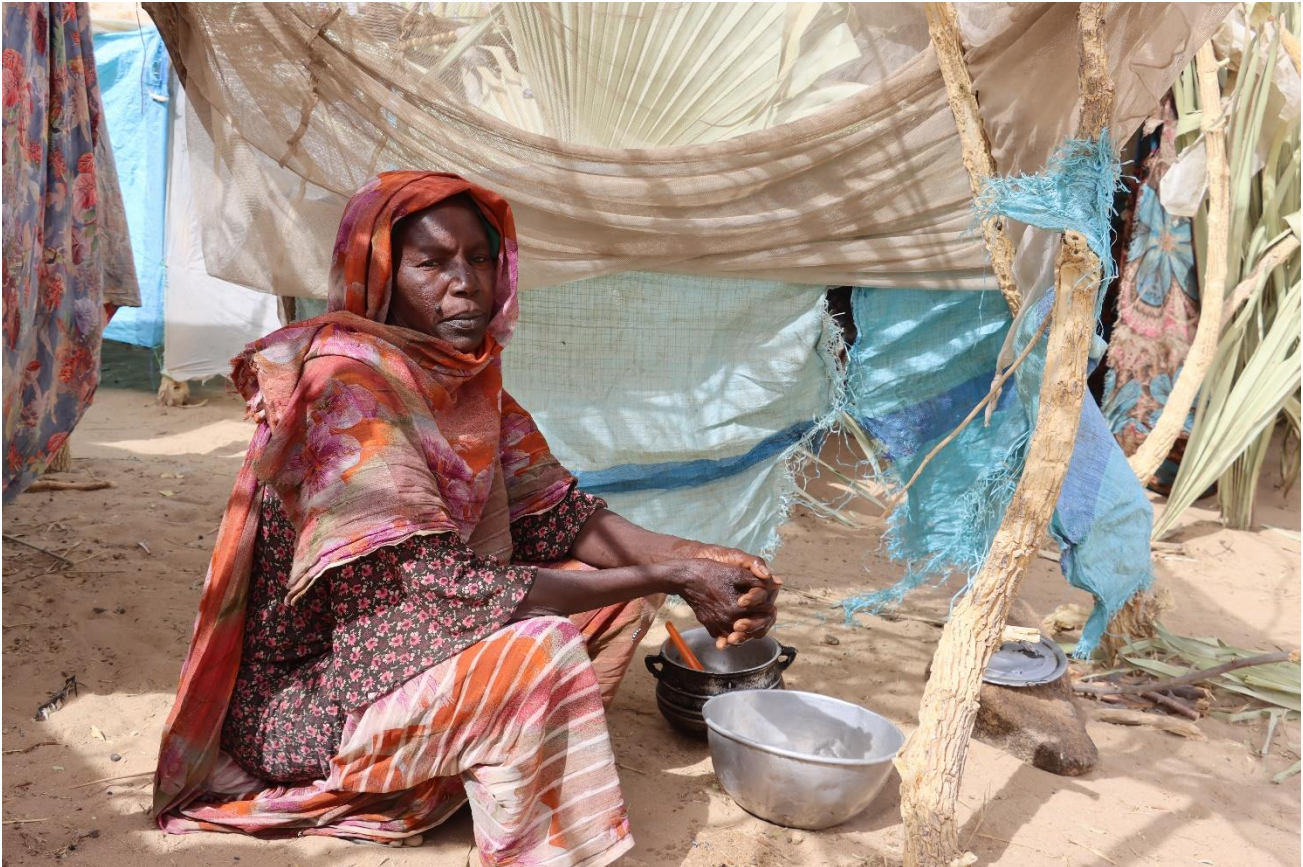
A woman has found refuge in Chad following the outbreak of fighting in Sudan on 15 April 2023.