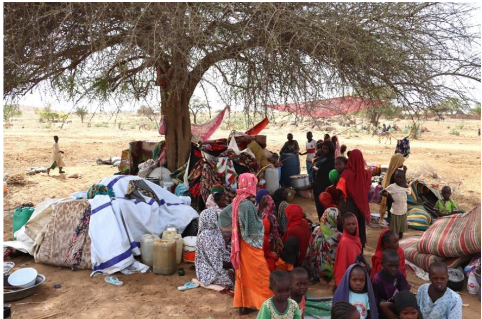
Sudanese refugees shelter under a tree in a village 5km across the border in neighbouring Chad.

refugees being hosted by Sudan to other neighbouring countries.