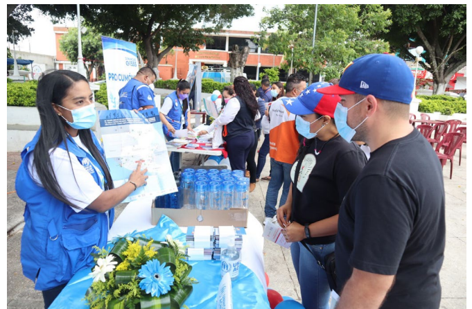
Informative fair in Jutiapa for World Refugee Day.