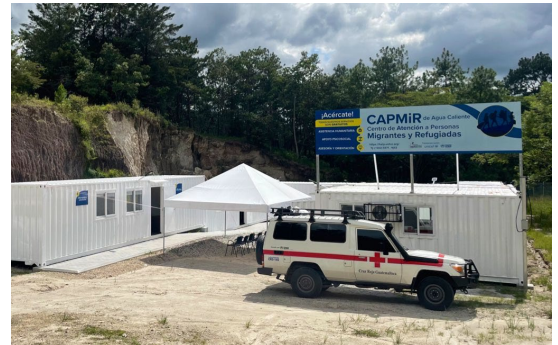
Attention Center for Migrants and Refugees (CAPMiR) in Agua Caliente, Esquipulas.