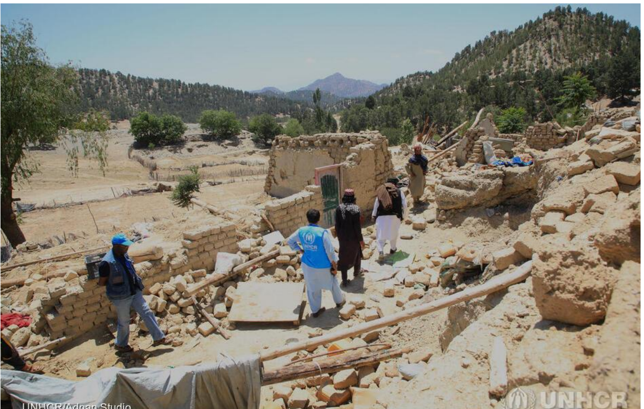
A UNHCR assessment team walks through the rubble in a village in Spera District, Khost Province where some 100 families who were made homeless by the earthquake were provided with UNHCR tents, household supplies, and dignity kits.

On 22 June 2022 a 5.9 magnitude earthquake struck vulnerable districts in Paktika and Khost provinces, south-eastern Afghanistan. Over 1,000 people are estimated to have been killed, including 250 children , while an additional 3,000 people were injured, among them 600 children. At least 1,500 homes are reported to have been damaged in Giyan district of Paktika province alone. Interagency teams including UNHCR were quickly on the ground to assess the situation. Findings from rapid assessments reaffirm the extensive damage to houses, absence of (and lack of access to) basic services such as water, education, health, electricity, access roads in remote locations, and lack of viable livelihood opportunities. It is estimated that at least 70% of the houses in the most impacted areas are damaged or destroyed, leaving many without shelter and sleeping in the open, prone to harsh weather, health and protection issues, and other hazards. A US$110.3 million multisectoral earthquake appeal released by OCHA (including the needs of UNHCR), targets 362,000 earthquake-affected people across south-eastern Afghanistan with essential aid like emergency shelter support, food assistance, health support and protection.