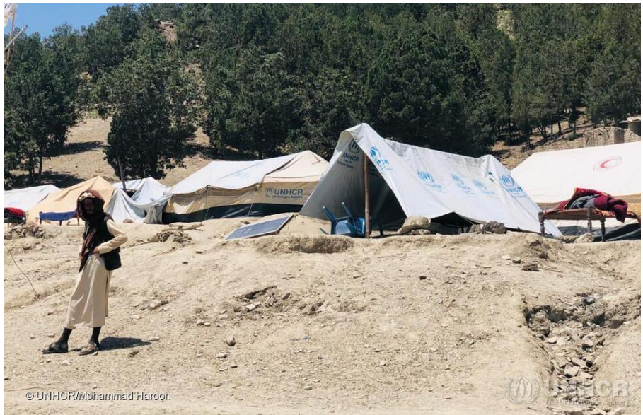
Earthquake survivors take shelter in UNHCR tents and under plastic tarpaulins in a village in Spera District, Khost Province. UNHCR teams were on hand to provide families with urgently needed shelter materials, household items, and dignity kits for women and girls.

Following interagency assessments, UNHCR's immediate response involved the distribution of 1,600 shelter and non-food item (NFI) kits (including tents) and 1,500 dignity kits for vulnerable women and girls. The UNHCR response has already benefited a total of 12,700 affected individuals in Khost and Pakitka provinces. While UNHCR and partners continued to implement their emergency response to the first earthquake, several aftershocks have been felt, and on 18 July a new 5.1 magnitude earthquake hit Spera district (only 3km from the epicentre of the June earthquake), also impacting Barmal, Giyan, and Zuruk districts, and causing further destruction. As of 4 August, an additional 1,992 family tents have been dispatched to support newly assessed families in Spera district.