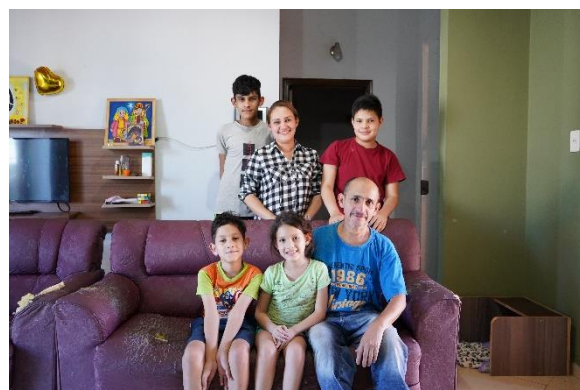
Venezuelan family starts a new life in Asunción.