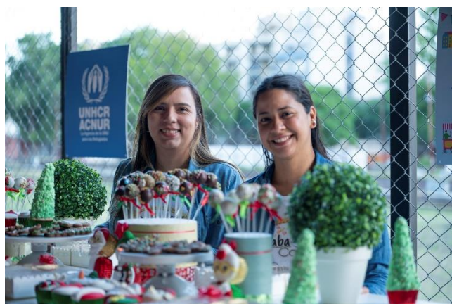
Venezuelan entrepreneurs offering their products during the Festival del Reencuentro in Buenos Aires.

Field presences in Cordoba, Mendoza and Salta