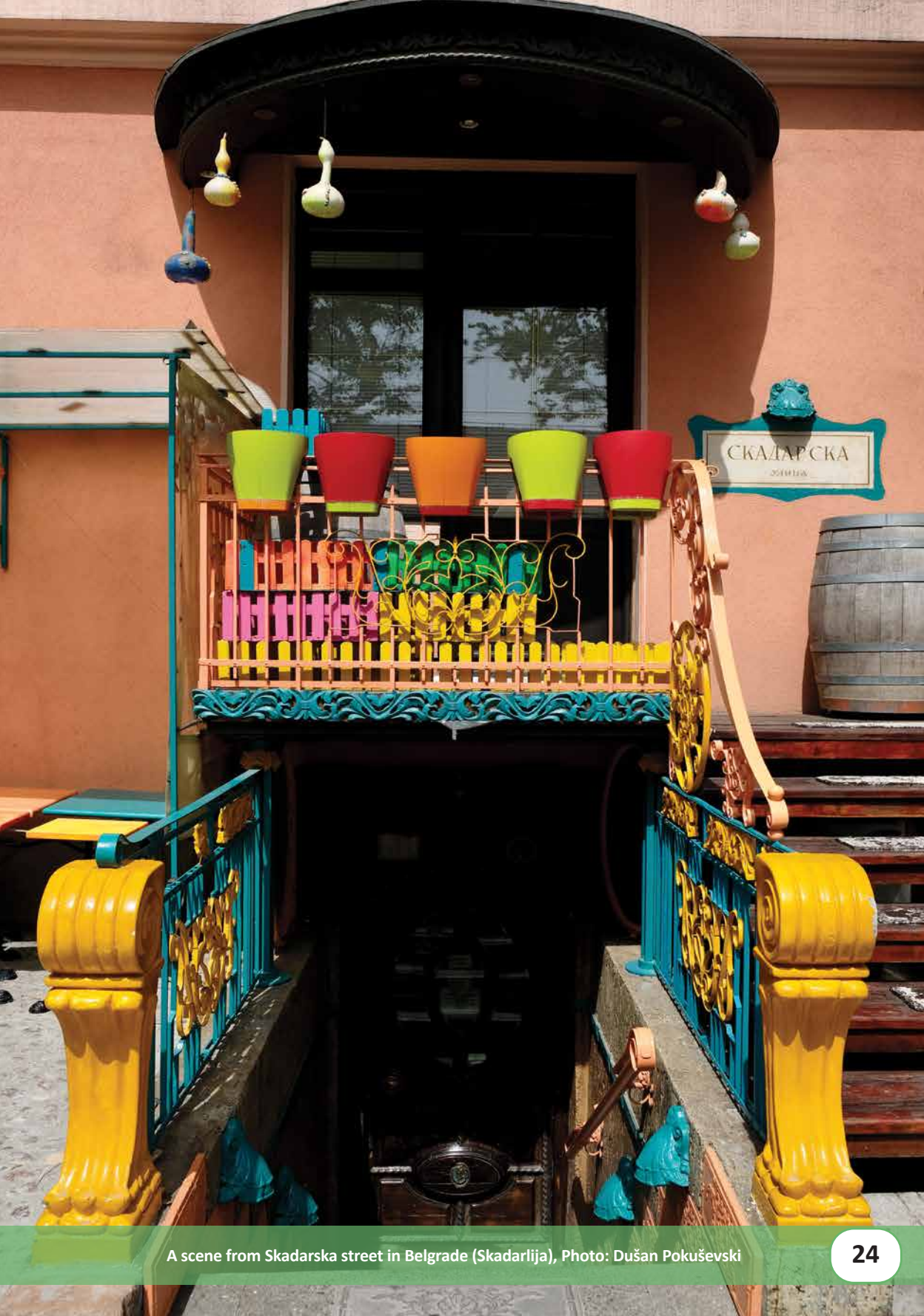
A scene from Skadarska street in Belgrade (Skadarlija), Photo: Dušan Pokuševski