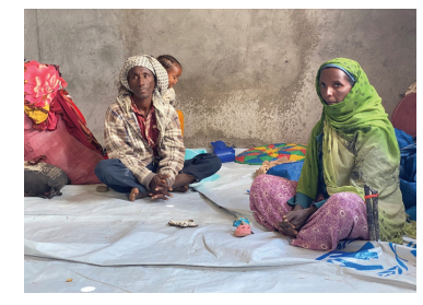
IDP family recently relocated from Sunflower IDPs site in Debre Birhan, Amhara.

UNHCR is grateful to donors contributing towards the Northern Ethiopia emergency response in 2022: Canada | CERF | Country-Based Pooled Funds | Denmark | European Union | Finland | France | Germany | Italy | Japan | Liechtenstein | Luxembourg | Norway | Private donors | Sweden | Switzerland | United Kingdom | USA