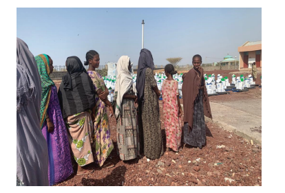
UNHCR distributing core relief items to IDPs in Samara IDP site, Afar. ©UNHCR/Mocanasu O/March 2022