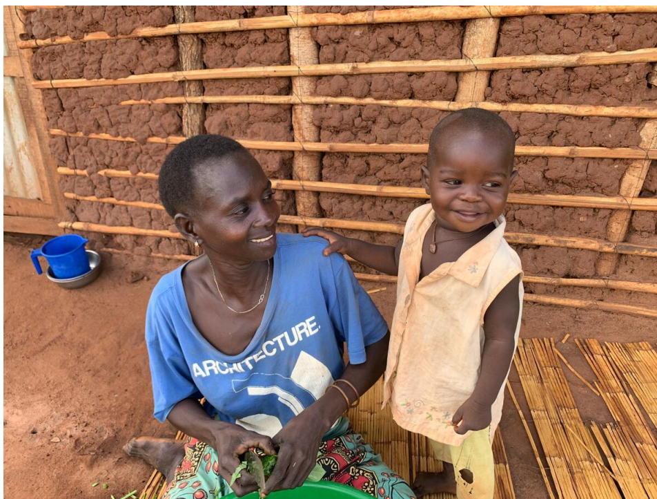
A mother and child living in Corrane site for IDPs in Nampula Province, northern Mozambique, prepare food.

COVID-19: 5,000 more refugees, asylum-seekers and internally displaced persons (IDPs) vaccinated in the region.