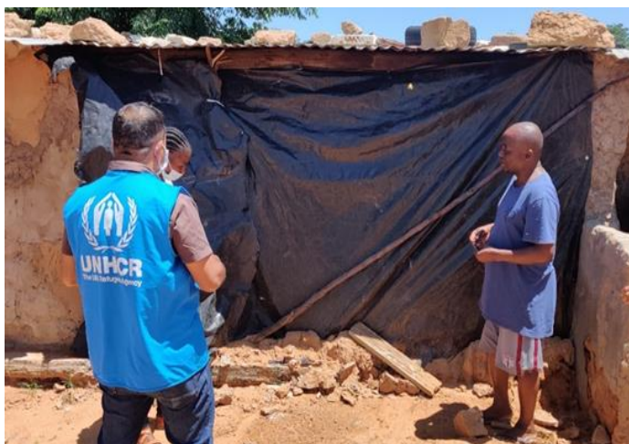
UNHCR and partner field staff speaking with families whose dwellings were damaged in Osire refugee settlement, Namibia.