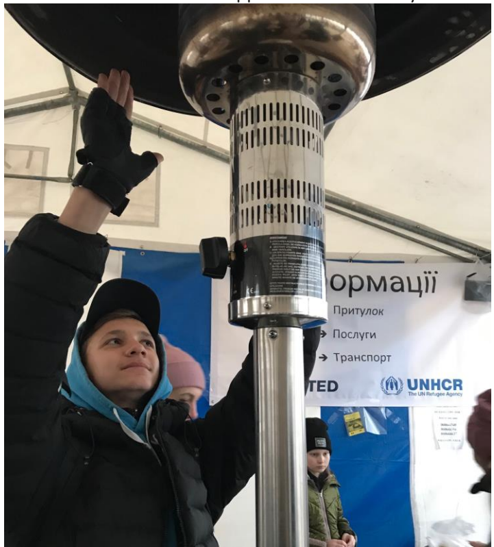
At the Palanca bus station, heaters are installed in the waiting area

Education Working Group (EWG) is established and co-chaired by UNICEF and UNHCR. The group will coordinate the education intervention in support of the efforts by the Ministry of Education.