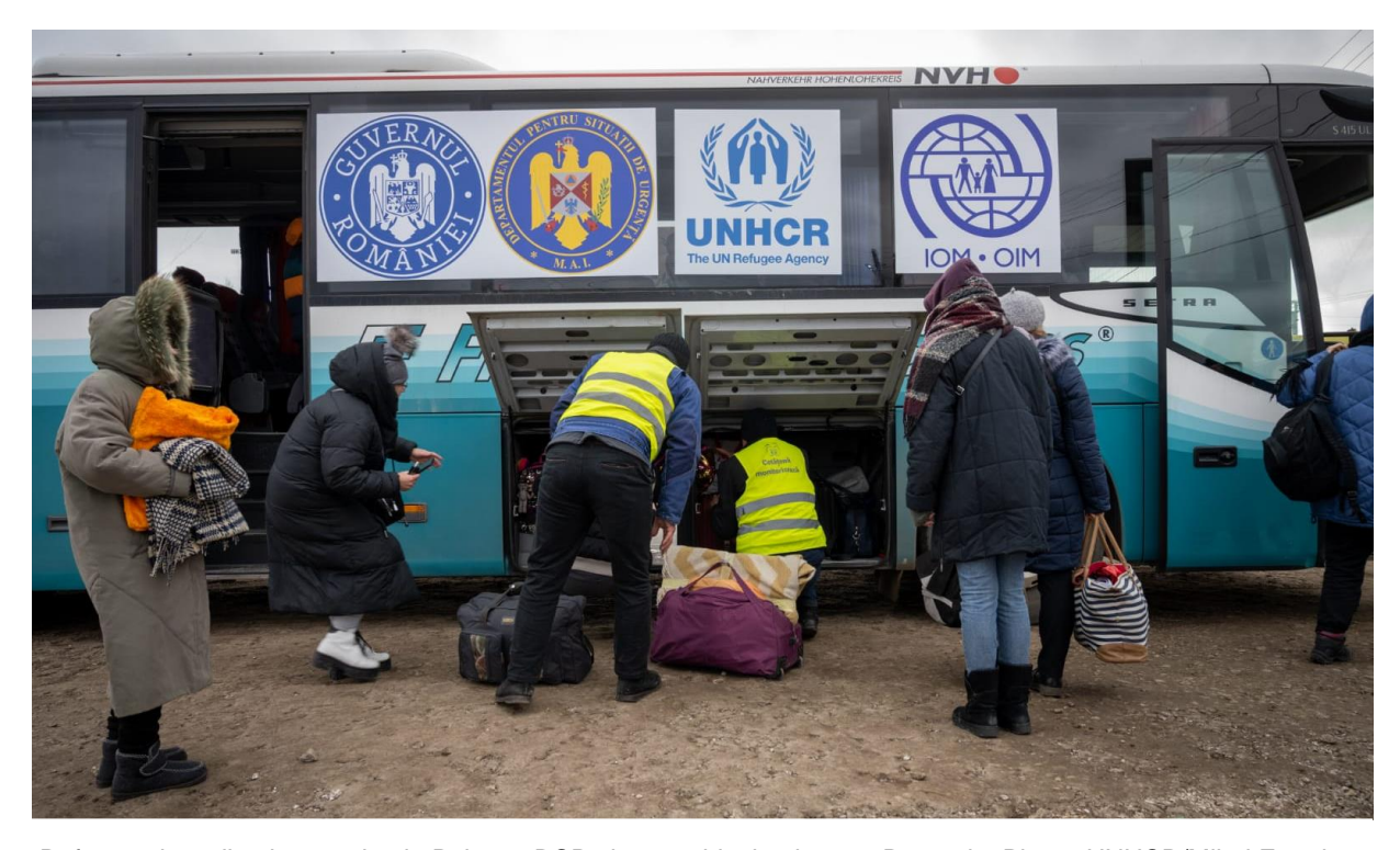
Refugees boarding bus station in Palanca BCP, that would take them to Romania.

• The Protection Working Group (PWG) based in Chisinau was formed with 37 partners, and co-chaired by the Bureau for Migration and Asylum (Minister of Internal Affairs) and UNHCR. The PWG commenced it work with an aim of supporting a comprehensive and coordinated protection approaches to Ukrainian refugee situation in Moldova. During its first meeting UNHCR presented an overview of the refugee statistics and potential protection concerns. The PWG has started to plan to have systematic thematic discussion on different protection topics and subgroups on Child Protection (co-lead by UNICEF/UNHCR), Gender (co-lead by UN Women/UNHCR), GBV Sexual and Gender Based Violence and PSEA (co-lead by UNFPA and UNHCR) have been formed.