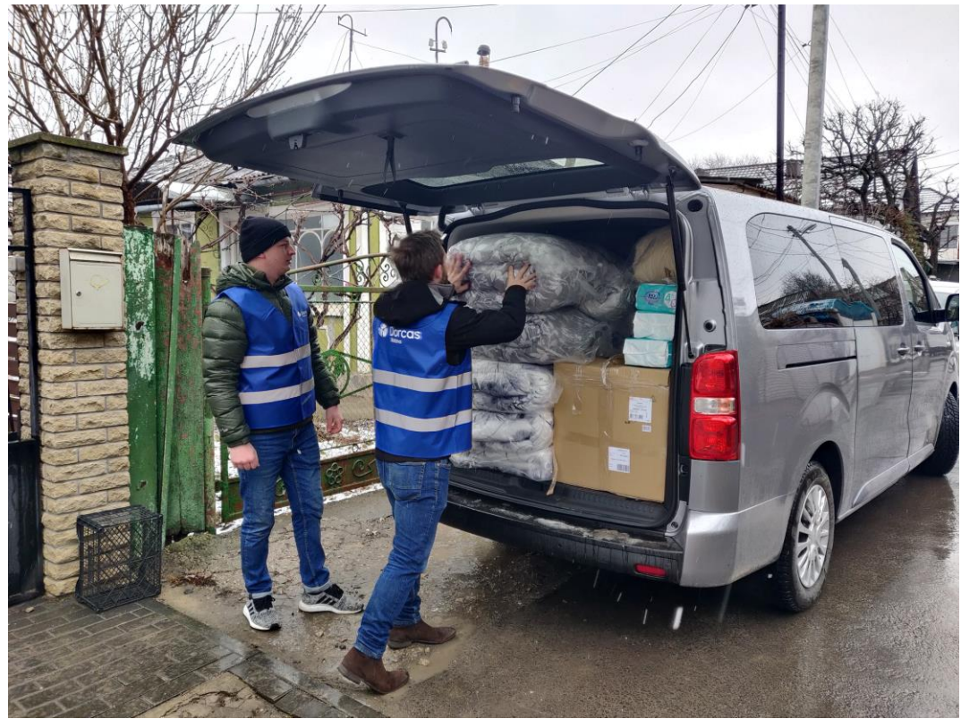
Dorcas volunteers loading blankets and assistance for distribution to Ukrainian families hosting refugees