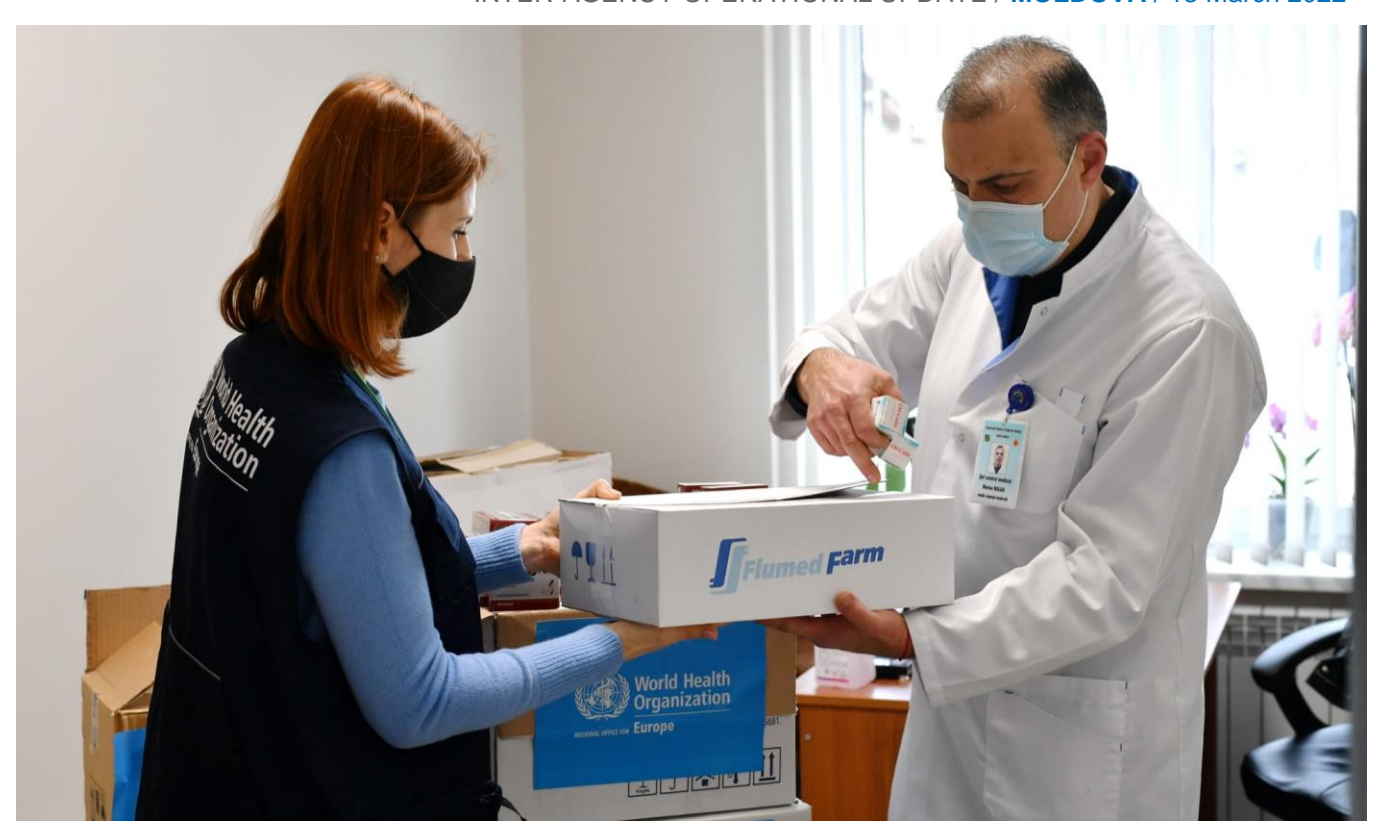
WHO Moldova donated essential medicines to Medical Department of the Border Police to use for the refugees needs