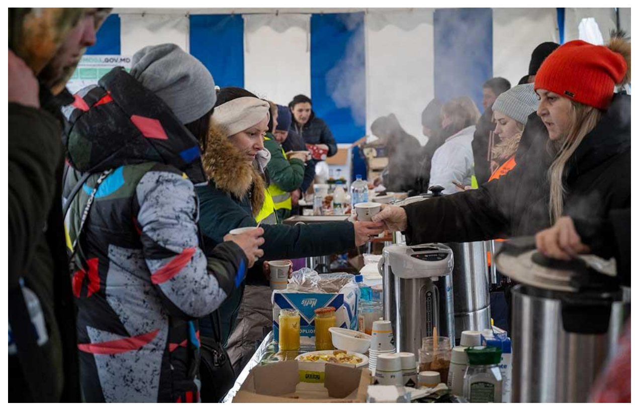
Volunteers serve hot food and drinks to Ukrainian refugees in Palanca, Moldova.