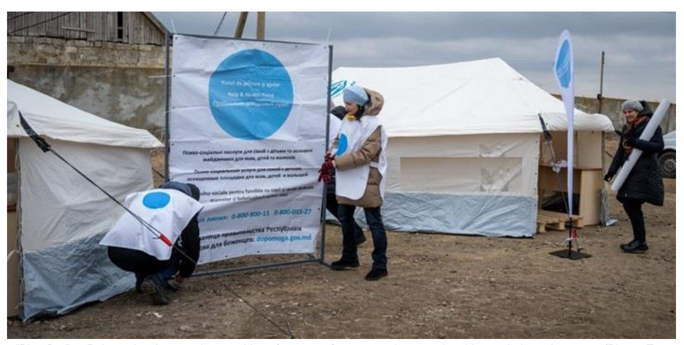
"Blue Dot" at Palanca border crossing provide safe spaces for community to seek guidance, help and support.