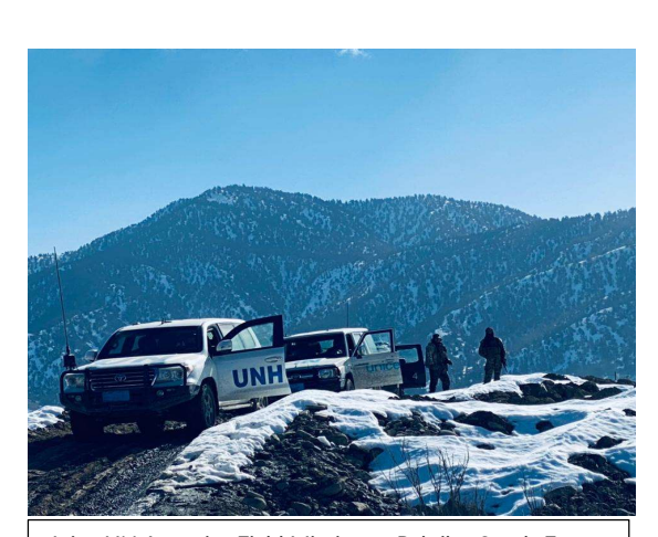
Joint-UN Agencies Field Mission to Paktika, South-East Afghanistan between Jan 29 – 3 Feb