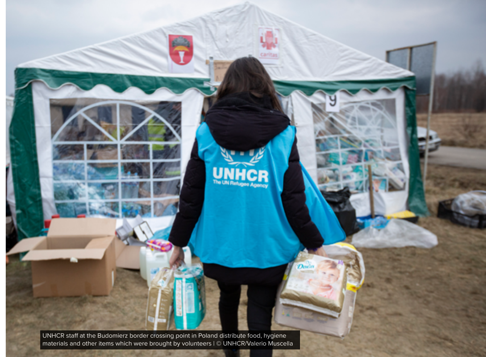
UNHCR staff at the Budomierz border crossing point in Poland distribute food, hygiene materials and other items which were brought by volunteers

The Global Focus situation page for the Ukraine Situation can be found here .