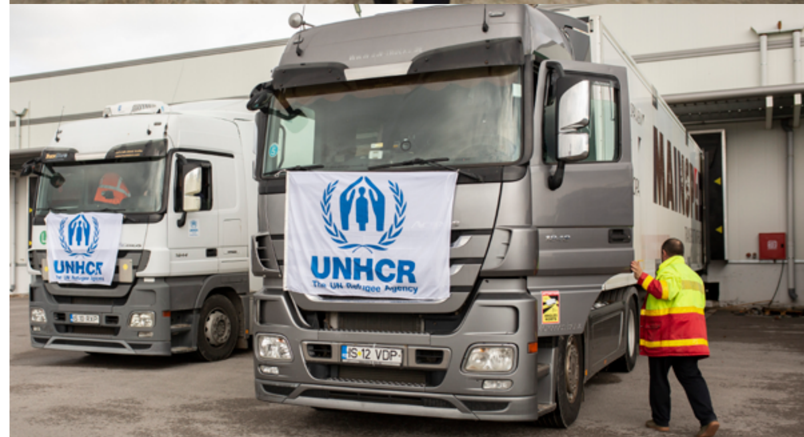
Trucks loaded with core relief items for the Ukraine emergency depart from UNHCR's warehouse in Athens heading for Moldova and Poland