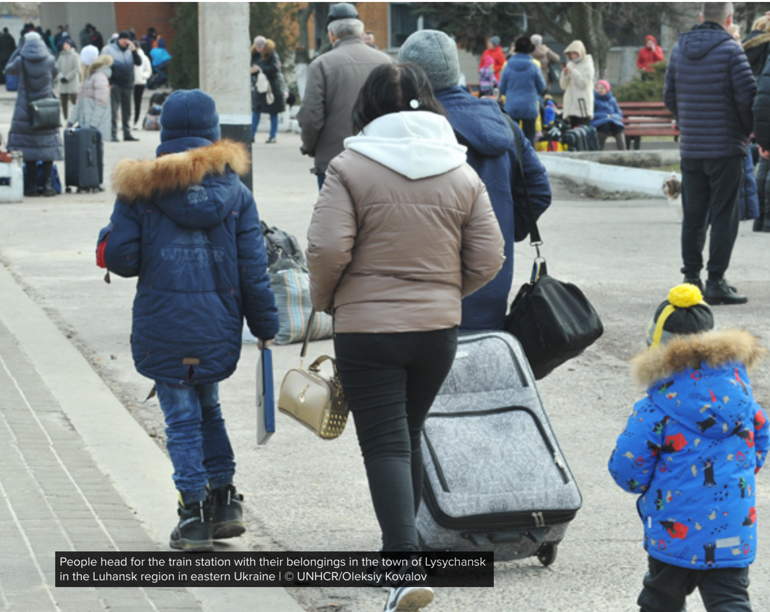
People head for the train station with their belongings in the town of Lysychansk in the Luhansk region in eastern Ukraine