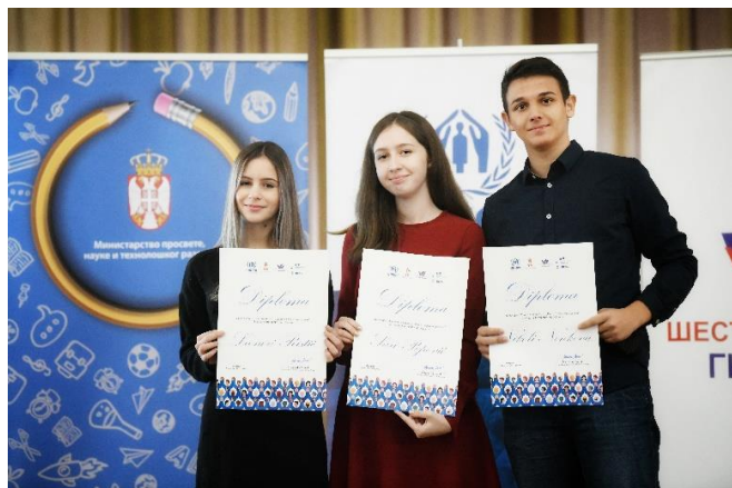
Winners in the category of "best essay" of "Welcome to My Country" Competition, Belgrade, December 2021

international organisations, frontline workers and media representatives who provided positive media coverage of this cohesion event.