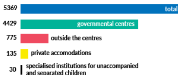
Figure 2: Number of refugees and migrants in Serbia's territory

December 2021 saw 2,713 (decrease by 35% comp. to November) pushbacks from neighbouring countries to Serbia (89% from Hungary, 9% from Romania and 2% from Croatia). Nationals of Syria make up 46% of all the pushbacks and persons originating from Afghanistan make up 29%.