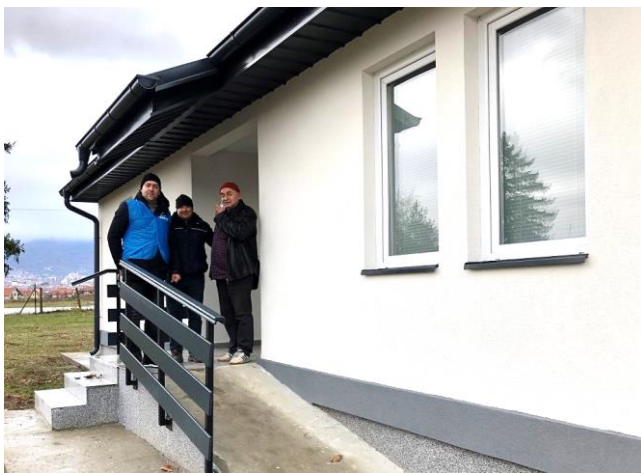
Finalised works on administration building of Vranje AC, @UNHCR, December 2021

UNHCR participated in an annual panel discussion "Challenges in the Process of Integration – higher education of refugees" , organised by BCHR on 23 December in Belgrade and via Zoom platform. The results of the "Survey on Perceptions of Citizens of Refugees and Migrants" were presented at the event.