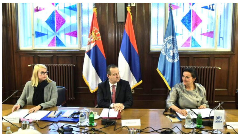
Conference marking 70 th Anniversary of the Refugee Convention and 45 years of UNHCR in Serbia, Belgrade, @UNHCR, December 2021

In total in 2021, the Asylum Office granted subsidiary protection to seven and refugee status to another seven asylum-seekers.