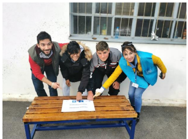
Friendship benches were assembled in Obrenovac AC, Belgrade, December 2021

On 6 December, UNHCR and CRPC partnered with the School for Hospitality and Tourism in Belgrade and GRAD Cultural Centre and organised the second Deli Monday international cuisine festival where refugees from Iran and Iraq and Serbian students jointly prepared Kurdish, Iranian and Serbian dishes , offered to members of the diplomatic corps, civil society,