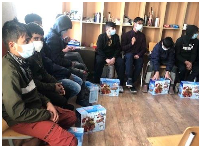
Partner Indigo distributed New Year's presents to UASC in Preševo RTC, December 2021