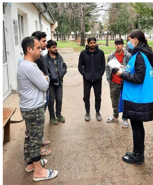
Asylum counselling in Obrenovac AC, Belgrade, @UNHCR, December 2021

UNHCR partner DRC organised interactive health awareness workshops on breast cancer early detection by breast self-examination, in the Women's Safe Space in Krnjača AC, for 18 refugee women of different age groups. Partner International Aid Network (IAN) held group sessions and educational workshops on sexual and gender-based violence, protection from sexual exploitation and abuse and influence of the holiday season on mental health for 31 participants in two asylum centres.