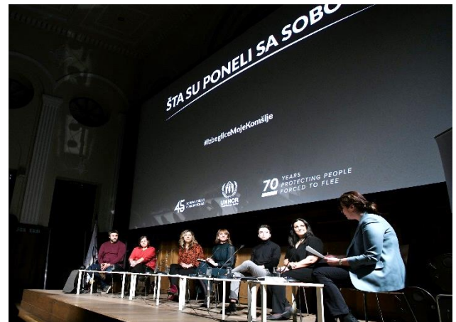
Premiere of What They Took With Them film with Serbian actors, Yugoslav Film Archive, Belgrade, @SCRM, 30 Nov 2021

Within the framework of the EU Service for Foreign Policy Instruments, partners Indigo, International Aid Network (IAN), Sigma Plus and CRPC implemented 260 individual and group psychological/psychiatric counselling, PSS workshops, creative, recreational and educational workshops in the centres country-wide. Some 30 students regularly attended Serbian lessons procured by the UNHCR. Partner DRC organized four women empowerment workshops in Women's Safe Space in Krnjača Asylum Centre for nine women asylum-seekers, and a participatory assessment with another five.