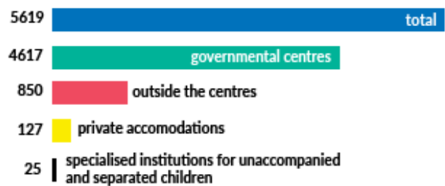
Number of refugees and migrants in Serbia's territory

A Syrian family of 6 members (mother and 5 children), who had been accommodated in Bosilegrad Reception Centre were successfully reunited with husband/father, a refugee in Austria, on 30 November. This reunification is the result of a joint effort of the Austrian Embassy in Belgrade, Austrian Red Cross, Ministry of Interior and the Serbian Commissariat for Refugees and Migration (SCRM), ICRC Western Balkans Delegation, the UNHCR and its partners Sigma plus and Crisis Response and Policy Centre (CRPC).