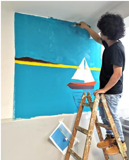
Decorating the walls of Technical School in Obrenovac, @UNHCR, Nov 2021

UNHCR and partners counselled 804 persons on asylum in November; 23 persons gave power of attorney to UNHCR project lawyers for representation in asylum procedures; 16 refugees received ID cards and three work permits with support from UNHCR.