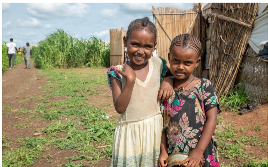
Two refugee girls pose for a photo outside their shelters in Um Rakuba camp in Eastern Sudan.

3 Field Units in El Obeid, Zalengei and Abu Jubayhah