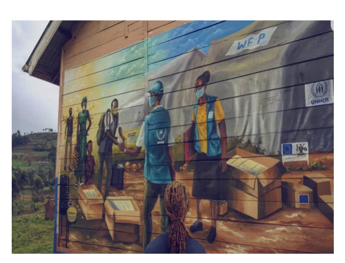
A mural painting, by refugee artists, shows distribution of food and non-food items during the COVID-19 pandemic in Uganda.

*Increase in number is attributed to the registration of the backlog of asylum seekers and new-born babies.