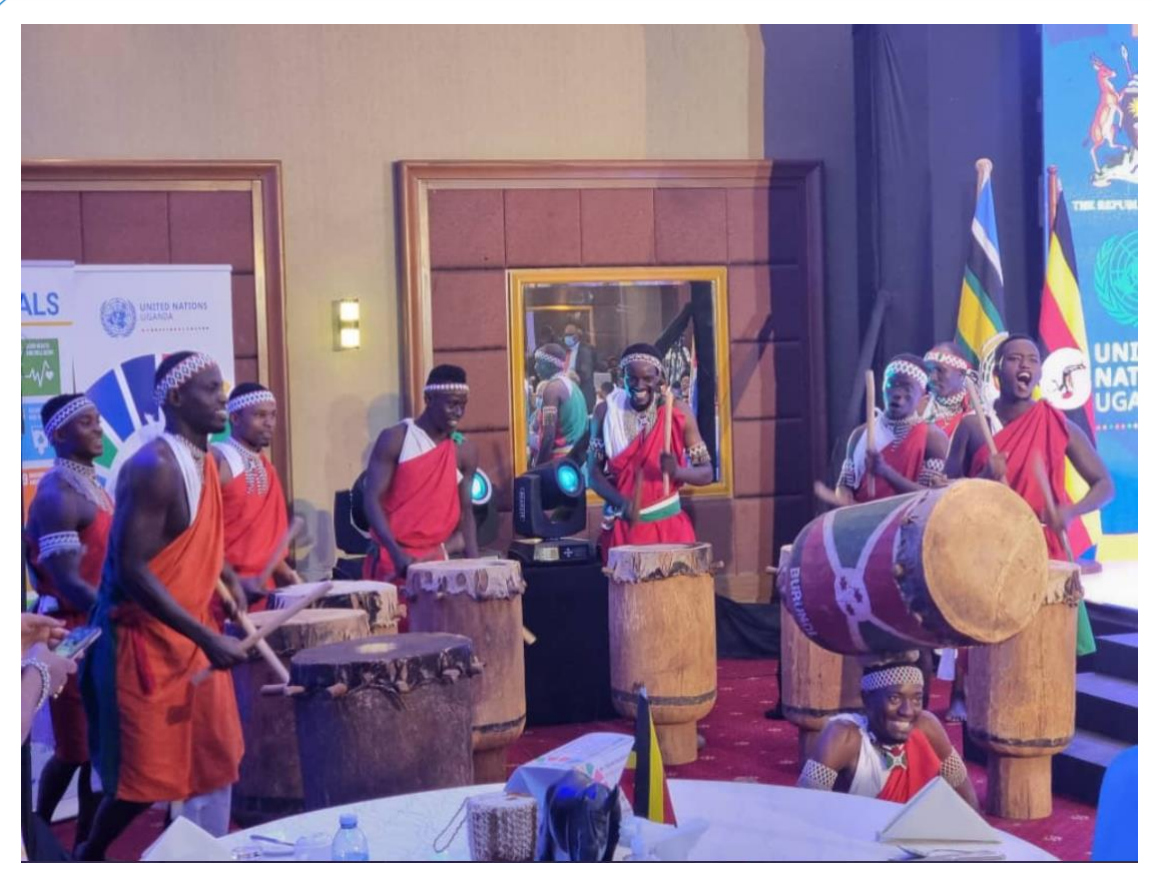
The Mirror Group, comprising urban refugees from the Burundi community, entertains guests at the 2021 United Nations Day celebrations in Uganda's capital Kampala.