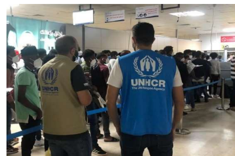
Staff assisting asylum-seekers at Tripoli International Airport as they prepared to leave for the evacuation flight to Niger.

On 3 November , long-awaited resettlement departures resumed with the first refugees departing to Sweden. On 4 November , the first humanitarian evacuation flight to Niger in more than a year, via the Emergency Transit Mechanism , departed from Tripoli. 172 asylum-seekers from a mix of nationalities were flown to safety, including 31 women and 27 children – one, born just a few weeks ago. Over the last week, UNHCR also facilitated the reunification of four asylum-seekers with their family members