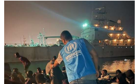
UNHCR staff providing assistance at the disembarkation point.

So far in 2021, a total of 27,551 asylum-seekers, refugees and migrants have been reported as rescued/intercepted by the Libyan Coast Guard (LCG) . During the week of 30 October and 3 November, five disembarkations took place in Tripoli Naval Base and Azzawya Oil Refinery Point, with 595 individuals returned, including 58 women and 25 children. UNHCR and medical partner, the International Rescue Committee (IRC), were present at the disembarkation points to provide urgent aid and medical assistance. So far this year, 201 boats have been disembarked; 347 persons have been missing and 109 bodies have been recovered.