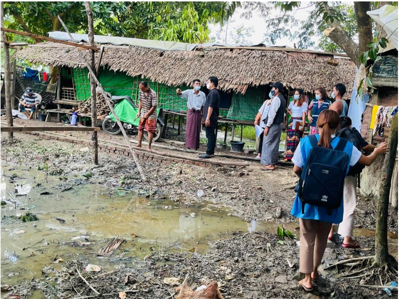
UNHCR staff carries out displacement conditions monitoring at an IDPs displacement site as the Camp Coordination and Camp Management lead in Rakhine State @UNHCR

The latest wave of violence across the border in Myanmar has seen new arrivals crossing into the Indian states of Manipur and Mizoram; the number may increase in the coming days. In terms of the humanitarian situation, there is an urgent need for food and shelter, winterization support and education/recreational kits for children, which is only partially met so far as the civil society and the host community resources become depleted as the crisis wears on.