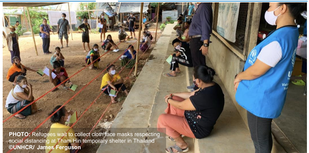
PHOTO: Refugees wait to collect cloth face masks respecting social distancing at Tham Hin temporary shelter in Thailand

1 Multi-Country Office in Bangkok 2 Field Offices in Mae Hong Son and Mae Sot