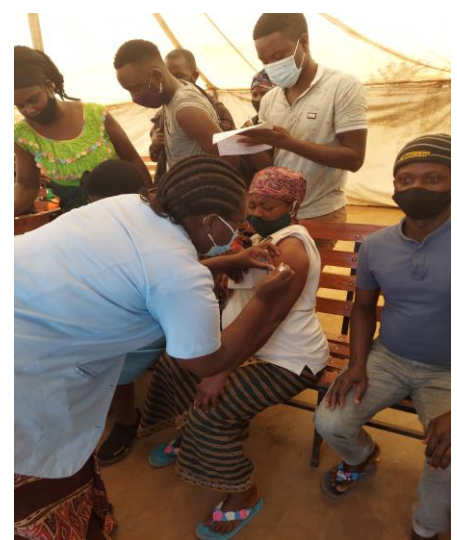
Refugees receive COVID-19 vaccinations at Dzaleka Health Centre.