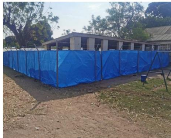
(Left) Karonga transit shelter isolation site with installed lights; (right) a partition fence enclosing the transit shelter kitchen.