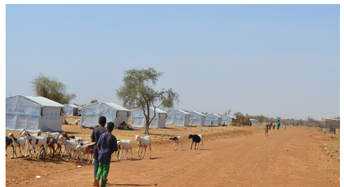
A partial view of Goudoubo after refugee's relocation