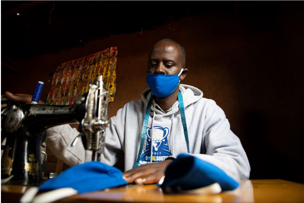
UNHCR Burundi Refugees

In Uganda , the Government, UNDP, UNHCR and partners launched the Jobs and Livelihood Integrated Response Plan for Refugees and Host Communities (JLIRP) , which envisions self-reliant and resilient refugee and host community households in refugee hosting districts included in a sustainable manner in local development by 2025.