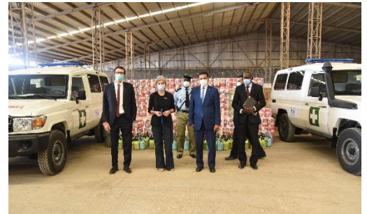
The handing-over ceremony of the ambulances at the presence of the Mauritania Ministry of Health

Norway | Sweden | Netherlands | Denmark | Private donors Spain | Germany | France | Switzerland | Private donors Republic of Korea | Ireland | Belgium