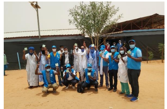
UNHCR Staff, refugee community leaders and health workers after receiving the first shot of COVID-19 vaccine in Bassikounou