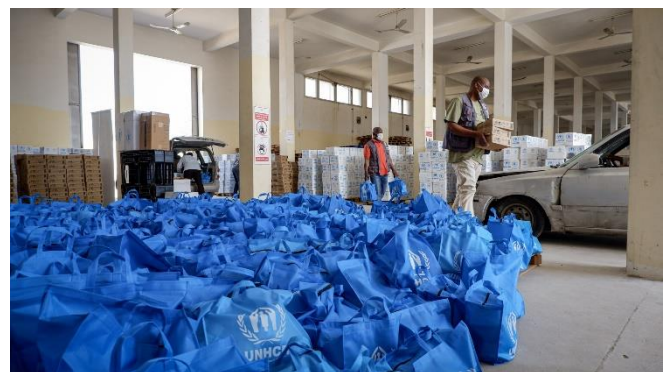
Ramadan food packages being distributed to refugees in Tripoli.

In coordination with the World Food Programme (WFP), UNHCR has started its Ramadan food distribution campaign in Tripoli and surrounding cities. The distribution has continued throughout the week where 5,339 refugees and asylum-seekers (1,454 families) are being targeted in Tripoli, while some 4,000 others are to be targeted in Al Zawiya, Zwara (102 km west of Tripoli) and Misrata (190 km east of Tripoli).