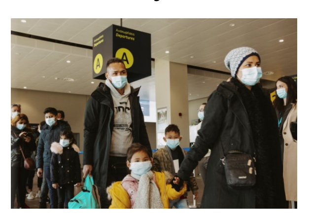
A family of Afghan refugees walk towards their boarding gate at the Mytilene airport, travelling from Lesvos to Germany, as part of the European relocation scheme. February 2021.