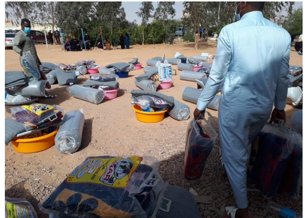
Provision of CRIs to IDPs in Sebha.

Special thanks to major donors: Canada | Denmark | European Union | Finland | France | Germany | Italy | Norway | Sweden | Switzerland | The Netherlands | United Kingdom | USA | Private Donors