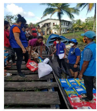
Food Distribution in Guyana -March 2021