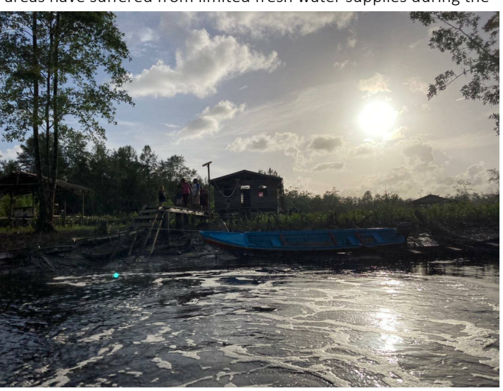
Imbetero community in Guyana.

The Villagepump will be handed over to the Guyana Water Incorporation (GWI), the national provider of water and sanitation services in the country, which will make the