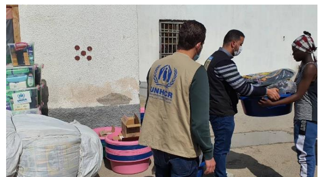
Distribution of assistance at Shari' Azzawiya DC.

UNHCR continues to distribute material assistance to internally displaced persons (IDPs), refugees and asylum-seekers. Some 1,900 IDPs in Al Ajelat (80 km west of Tripoli), Misrata (190 km east of Tripoli), and Derna (eastern Libya) have now received CRIs as part of UNHCR's winter campaign. Assistance included blankets, hygiene kits, winter clothes, socks, gloves, hygiene kits, plastic sheets and solar lamps. UNHCR also distributed CRIs to 705 refugees and asylum-seekers being held at Shari' Azzawiya, Al-Mabani and Al-Kufra detention centres. As of 3 March, UNHCR has distributed 56,116 CRIs to persons of concern across Libya.