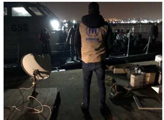
UNHCR present at the Tripoli Naval Base to provide assistance.

As of 2 March, 3,170 refugees and migrants have been registered as rescued/intercepted at sea by the Libyan Coast Guard and disembarked in Libya. On 2 March, some 100 individuals arrived at the Tripoli Naval Base. UNHCR and its medical partner, the International Rescue Committee were present at the disembarkation point to provide urgent medical assistance and core relief items (CRIs) before individuals were transferred to detention centres by the Libyan authorities.