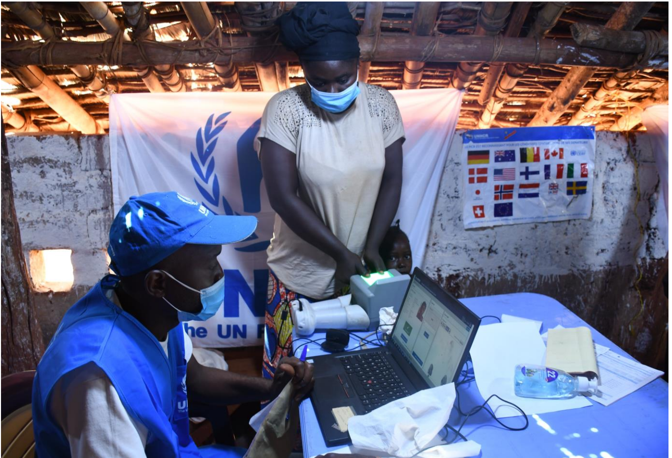
In Ndu village, Bas Uele province, UNHCR and the DRC National Commission for Refugees have started biometric registration of people who fled Bangassou in CAR.