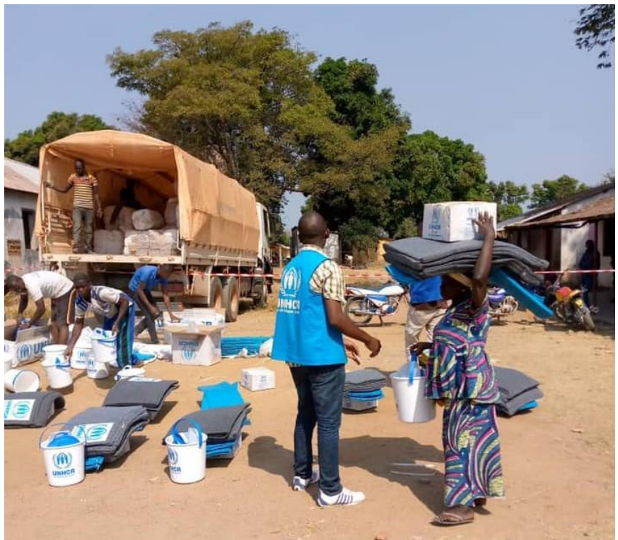
UNHCR continues to provide emergency assistance to the most vulnerable people affected by the current crisis in CAR, here in the SOS village IDP site in Bouar (Nana Mambéré).