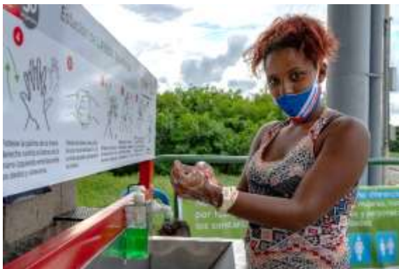
Assistance to refugees and migrants through hand-washing points.

During November, 366,700 beneficiaries received one or more types of assistance related to water, sanitation, and hygiene from 33 RMRP direct and implementing partners in 39 municipalities of 15 departments. Due to heavy rains and the impacts of hurricanes Eta and Iota, the Sector provided a comprehensive response with the delivery of water, hygiene items, flood kits, and repairs to some water systems in the communities of informal settlements that were affected by flooding and damages to their housings. The response was focused on the departments of Atlántico, La Guajira, Norte de Santander and Arauca. Also, given the rise in the number of refugees, migrants and returnees entering Colombia through Norte de Santander and Arauca, the Sector increased its response with the delivery of water and hygiene items to the population transiting by foot.