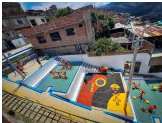
Improvement of community structures for refugees and migrants in Cali, Valle del Cauca. / NRC

*Organizations included in parentheses are implementing partners. Organizations separated by slashes (/) represent jointly implemented activities.