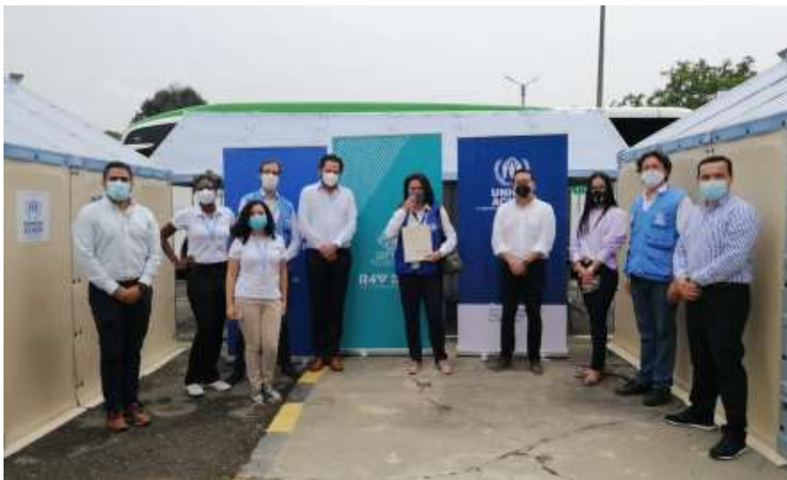
The local GIFMM coordination team accompanied the Border Manager and National Government officials during the field visit to Valle del Cauca.