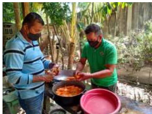
Workshop on food and nutrition education for refugees and migrants in Bocas de Jujú, Arauca.

In November, more than 431,500 beneficiaries received one or more types of food and nutrition assistance through 48 RMRP direct and implementing partners, in 67 municipalities of 15 departments, in border and transit areas, as well as areas where refugees and migrants have an intention to stay. The Food Security and Nutrition sector identified the need to increase synergy and integrality, effectively reduce vulnerability, and facilitate communities' progress through coordinated work and opportunities for integration with other sectors. One example of this happens in La Guajira, where is the rehabilitation of water points and rapid food productions through articulated actions is critical. Finally, the sector identified that some rural communities assisted by FNS's emergency actions, for which an articulated response and complementary efforts with the Integration sector are required.