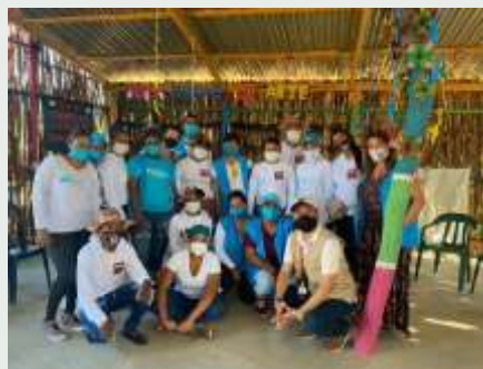
Delivery of food supplies in La Guajira.

In order to provide greater attention to refugees and migrants from Venezuela, War Child and its program “Safer Together!” ( ¡Juntos más seguros! in Spanish) opened three protection spaces in the Airport settlement located in the municipality of Uribia, in the department of La Guajira. However, War Child allied with SOS Children's Villages, also present in this settlement with two protective and educational spaces, to reach and assist more population by integrating efforts and providing comprehensive care to everyone.