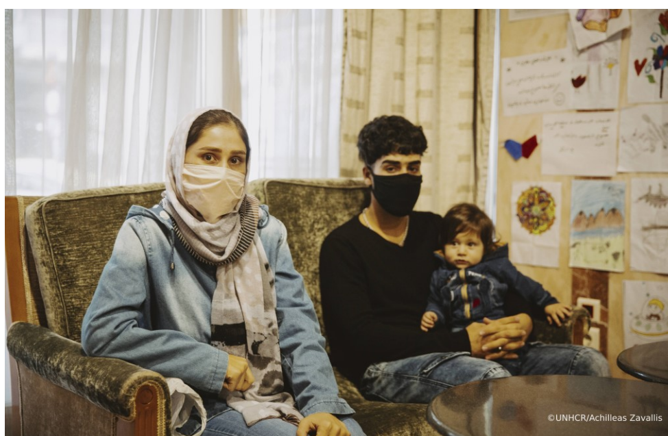
A family of asylum-seekers from Afghanistan wait in a hotel room in Athens for their relocation flight to Germany.