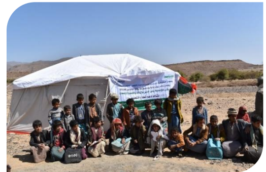
With the support of UNHCR and partners, IDP children were able to resume learning in designated educational tents in Al-Haifah IDPs hosting site, Al-Jawf Governorate.

With the support of UNHCR, as part of camp maintenance activities, partner YARD provided educational tents equipped with chairs and blackboards to provide a safe and suitable learning environment for more than 600 displaced Yemeni children and members of the host community. As per assessments results, one of the main results for children to drop out of schools is due to the lack of a safe educational environment. Following the launch of the new education facilities, students quickly resumed their courses at a significantly higher rate than previously reported.