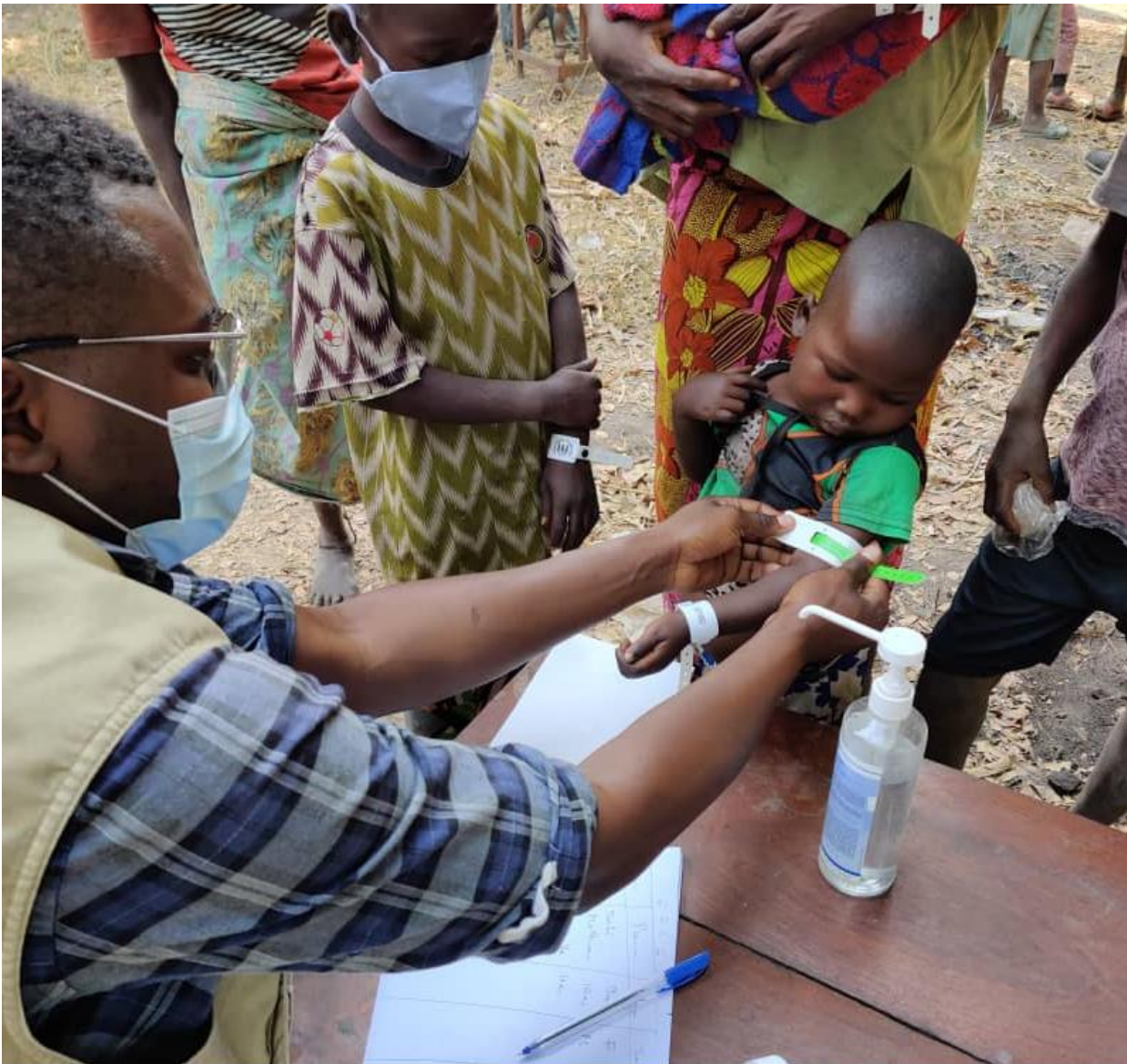
Nutritional screening for children in Ndouba

CSSI (UNHCR's health partner) ensures a regular presence in the villages hosting new arrivals and in the quarantine centers to provide medical consultations, screening, vaccination for children and pregnant women as well as nutritional screening . Serious