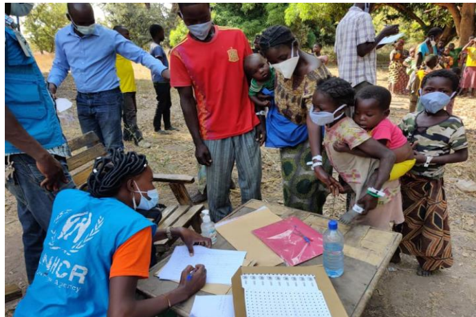
Level 1 registration for new arrivals in Kombat