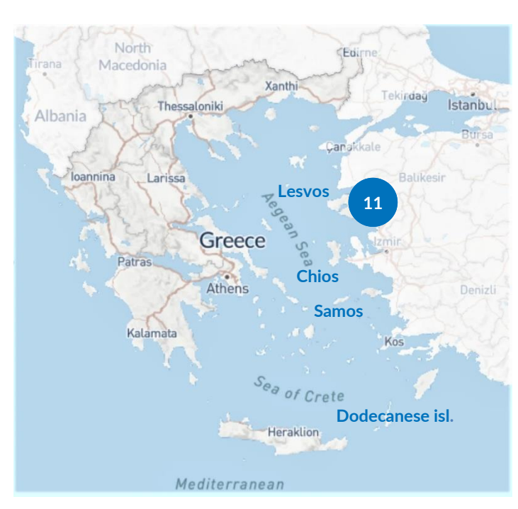
This week, 72 asylum-seekers departed, once authorized by the authorities, from the Aegean islands to the mainland.

Lesvos received the highest number of arrivals (11). Chios, Samos and the Dodecanese islands received no arrivals.