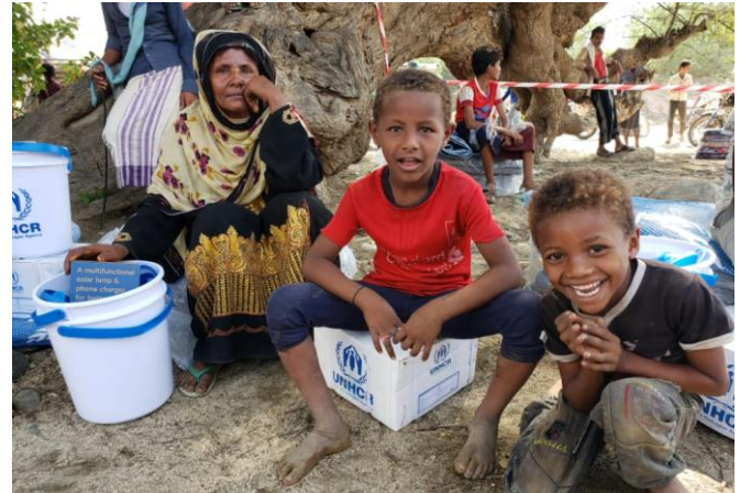
NFI distribution at Khairan, Hajjah.

UNHCR and partners provided non-food items (NFIs) to over 16,600 displaced persons in Marib, Al Baydah, Al Dhale'e, Taizz, Aden, Abyan, Shabwah and Al-Hudaydah governorates, while over 1,000 conflict-affected displaced families in Marib, Lahj and Al Hudaydah were provided with shelter assistance. In the south of Yemen, UNHCR through partners distributed 1,194 NFI kits and 272 Emergency Shelter Kits (ESKs) in Ibb, Taizz, Amanat, Al-Asima, Sana'a, Dhamar and Amran during the reporting week.