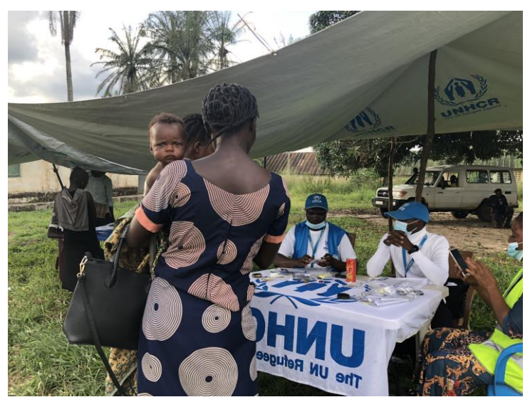
A displaced woman receiving cash assistance to meet her most urgent needs in Kakenge, Kasai Province.