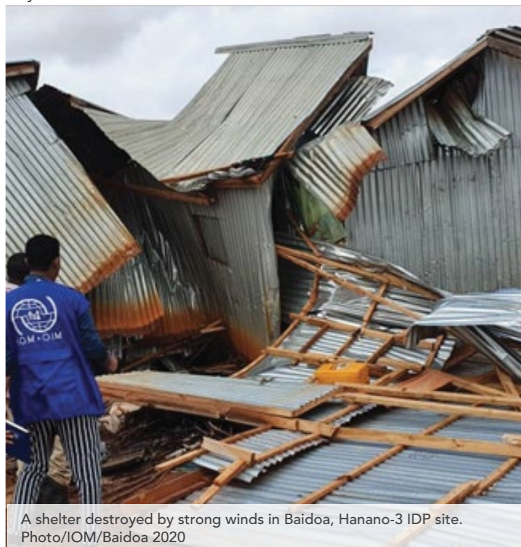
A shelter destroyed by strong winds in Baidoa, Hanano-3 IDP site.

Flood impact assessments conducted by CCCM partners noted more than 500 households living in Baidoa and Benadir were affected by the recent heavy rains. Partners provided flood mitigation awareness sessions with affected communities, and supported community members in establishing and rehabilitating drainage systems within IDP sites.