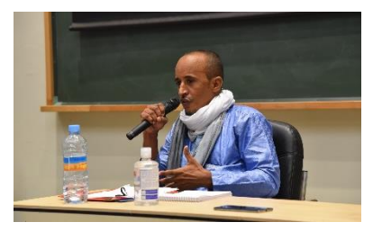
The Mauritania DAFI Club President during the UN75 dialogue

In collaboration with WHO, UNHCR organized the UN75 dialogue "Study the present to build the future" where DAFI refugee students discussed with the Nouakchott medical school students the importance of solidarity during the pandemic times. Together with UNDP, UNHCR took part in a radio show on peaceful coexistence broadcasted by the Bassikounou local radio. In addition to this, UNHCR also hosted in its facilities the