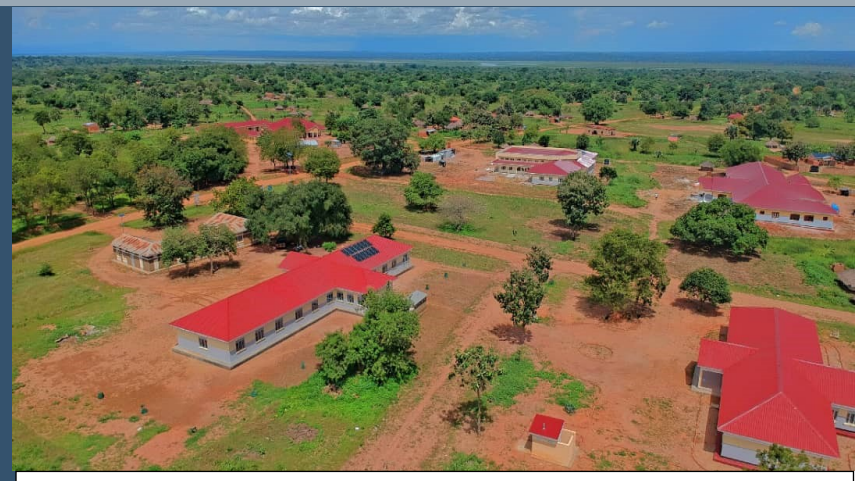
The newly constructed Obongi District headquarters. Obongi, where Palorinya Refugee Settlement is located, became a District in July 2019.