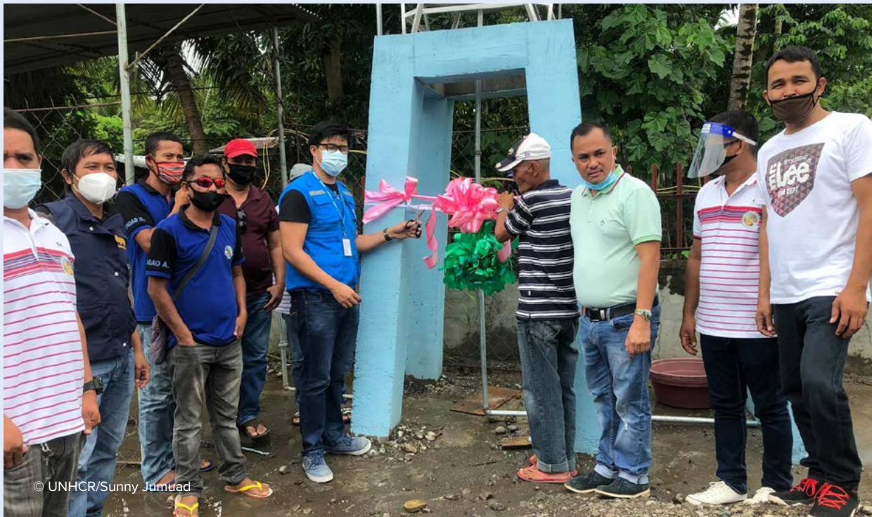
UNHCR implements low-cost Quick Impact Projects (QIPs) targeting the most vulnerable communities in Mindanao to promote community empowerment, advance peaceful co-existence between IDPs and host communities, and strengthen the resilience of IDPs.

To promote community empowerment, advance peaceful co-existence between IDPs and host communities, and strengthen the resilience of IDPs, UNHCR implements Quick Impact Projects (QIPs) targeting the most vulnerable communities in Mindanao. These projects are also envisioned to improve the overall protection of IDPs and help re-establish basic services in the communities such as safe water sources, sanitation and hygiene facilities, improve opportunities for livelihoods, and support social cohesion activities.