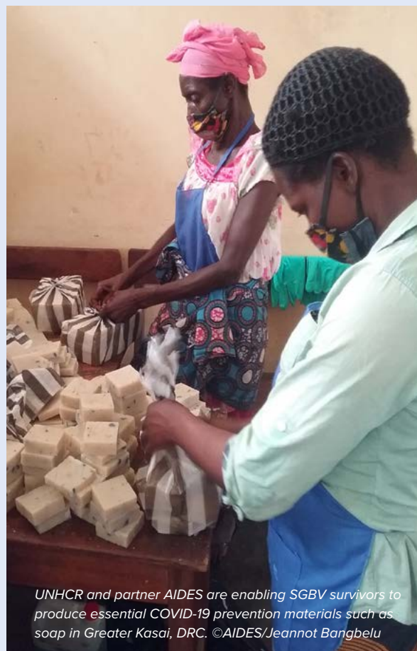
UNHCR and partner AIDES are enabling SGBV survivors to produce essential COVID-19 prevention materials such as soap in Greater Kasai, DRC.