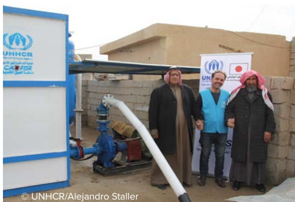
Rehabilitation of a Water Treatment Plant by UNHCR in Baghdad Governorate, Iraq.

voluntary return and reintegration where feasible, while also pursuing local integration and settlement elsewhere in the country. The United Nations, along with the international community in Iraq (humanitarian, development, stabilization, and social cohesion actors), are working to support the Government of Iraq in advancing durable solutions to internal and protracted displacement.