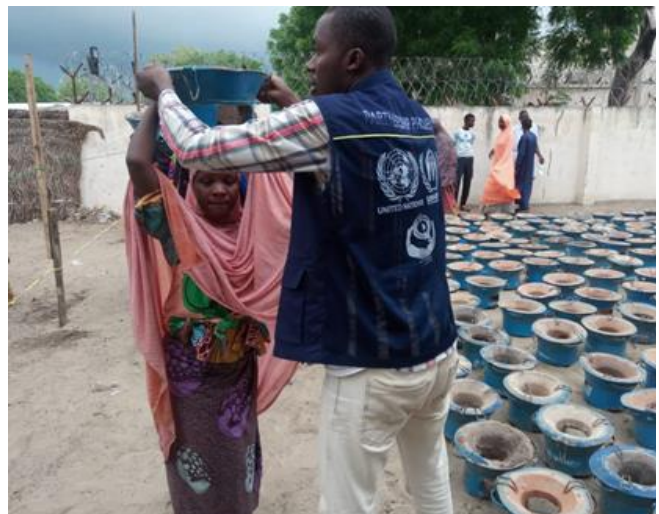
Distribution of Fuel-Efficient Stove in Monguno, Borno State.