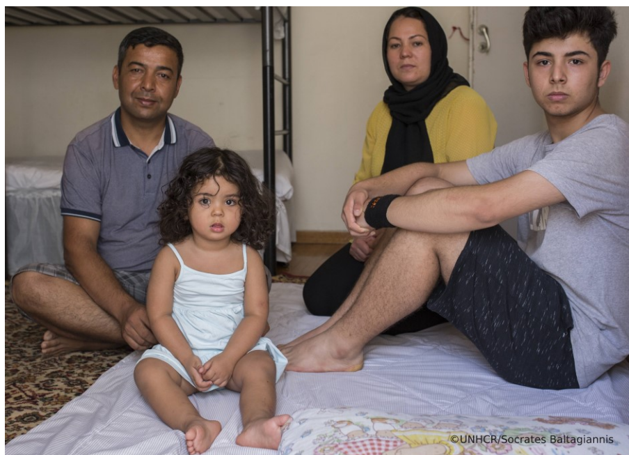
An Afghan family inside their apartment under UNHCR ESTIA accommodation programme in Athens.