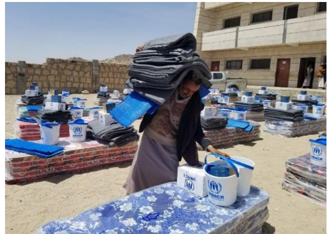
A displaced man receives basic household items for his whole family in Rajuzah district of Al Jawf governorate.

Number of IDPs under FO Sa'ada who received service, cash or in-kind support UNHCR June 2020